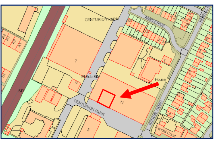
For Reference purpose only

The units at Centurion Trade Park are permitted to trade from 8am to 6pm, Monday to Saturday. A key code to the main gates will be given to each of the Tenants for access outside of these times.